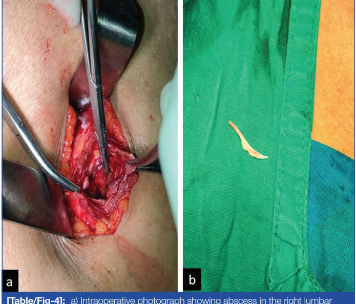
[Table/Fig-4]: a) Intraoperative photograph showing abscess in the right lumbar region. b) A curvilinear foreign body which was a long thin bone was found in the abscess cavity.

The patient underwent surgery under spinal anaesthesia. Ultrasound guided skin marking of the foreign body was done before the surgery. An abscess in the right lumbar region was opened and thick sludge with a 2.5 cm foreign body (a bone) was extracted from the abscess cavity [Table/Fig-4]. The foreign body was long thin, sharp ended, bone which had migrated by piercing through the ascending colon. The sludge was evacuated, and granulation tissue was curetted and sent for culture and sensitivity. The abscess was drained, and the foreign body was removed. The wound was closed with the drainage tube kept in-situ. The patient was administered broad spectrum antibiotics. The drainage tube was removed after 48 hours. The patient was discharged after five days. Follow-up after 15 days revealed no postoperative complications.