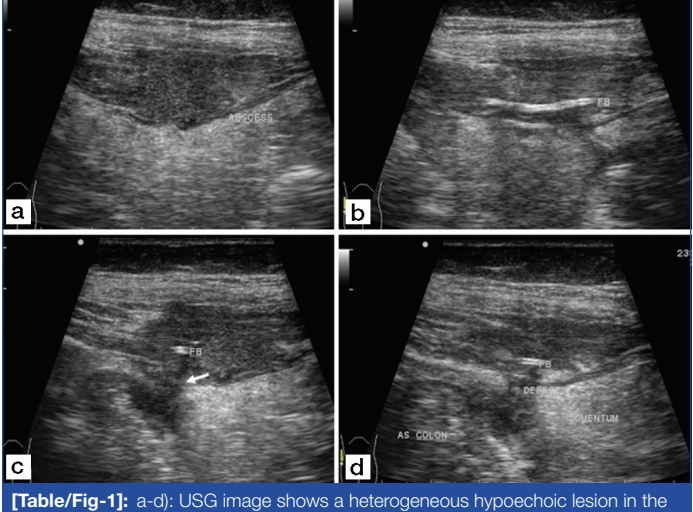
[Table/Fig-1]: a-o): USG image snows a neterogeneous hypoecnoic lesion in the preperitoneal plane; a) with a hyperechoic linear structure within the hypoechoic lesion; b,c) Representing abscess with the foreign body within. The abscess shows an intraperitoneal connection (white arrow) extending into the thickened wall of ascending colon which is adherent to the parietal peritoneum with adjacent inflamed omentum (c,d).

The patient was subjected to contrast enhanced CT scan after two days. CT revealed an ill-defined, hypodense, peripherally enhancing collection measuring 4.4×3×2.2 cm in the anterolateral abdominal wall in the right lumbar region [Table/Fig-2]. There was an intraperitoneal extension reaching up to the anterior wall of the ascending colon showing reactive wall thickening and adjacent fat stranding. No extravasation of oral contrast from ascending colon into the lesion, pneumoperitoneum any definite communication