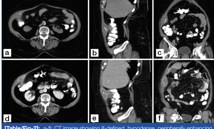
[Table/Fig-2]: a-f): CT image showing ill-defined, hypodense, peripherally enhancing collection in the anterolateral abdominal wall of the lumbar region on right side. A linear hyperdense non enhancing structure representing a foreign body is seen within the collection.

of the lesion with ascending colon was seen. A linear sigmoid shaped hyperdense (CT attenuation value: 322 HU) non enhancing structure of size 2.6 cm (length)×0.2 (thickness) cm was seen within the collection [Table/Fig-2]. The foreign body was very well demonstrated on Volume Rendering Technique (VRT) reformatted